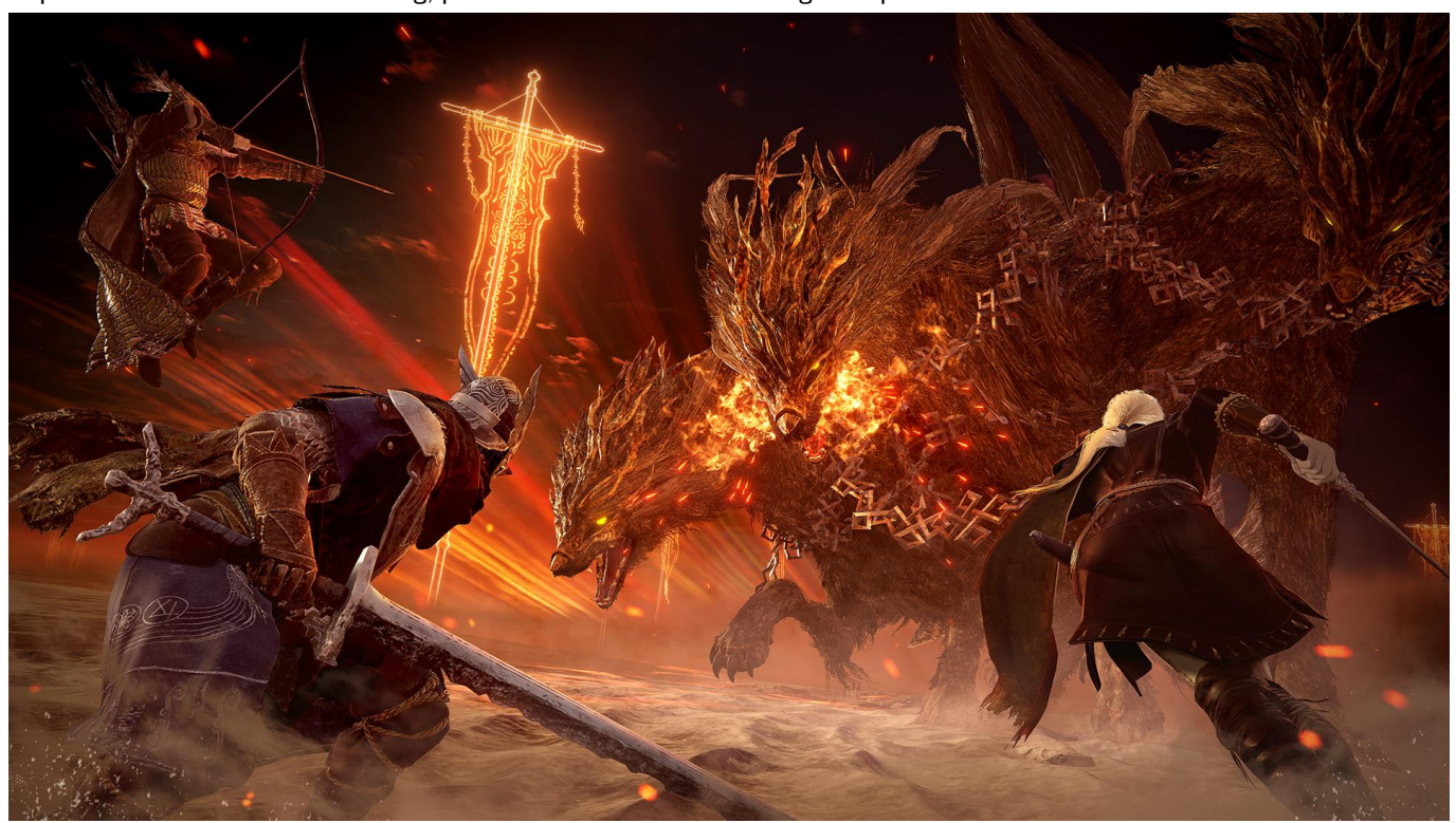
Players must work together to survive for 3 days within an expansive world.

A thrilling gameplay experience in which players can enjoy a fast-paced mix of RPG elements such as dungeon exploration and character leveling, paired with intense combat against powerful enemies.